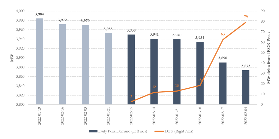
FIGURE 1: WEM DAILY PEAK DEMAND (TT30GEN) IN 2022, TOP 10 DAYS

By way of example, Figure 1 illustrates the daily peak demand in the WEM in 2021/22. It is unclear what the IRCR response was in any of the intervals listed in Figure 1. However, only a small change in total IRCR response would be required to change the ordering of peak demand days.