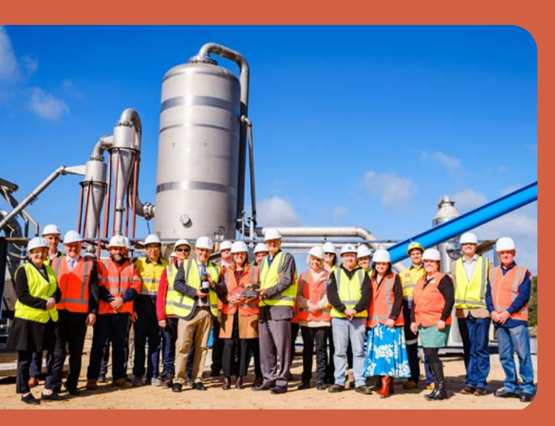
Opening of Renergi's Collie Resource Recovery Centre.

Using WA-built technology, the plant has a potential to revolutionise the way waste is managed across the State and beyond, placing Collie at the forefront of the negative-emission bio-based economy. With the facility creating up to 12 jobs, Renergi completed construction on the project in partnership with the Shire of Collie, with support from the WA and Commonwealth Governments.