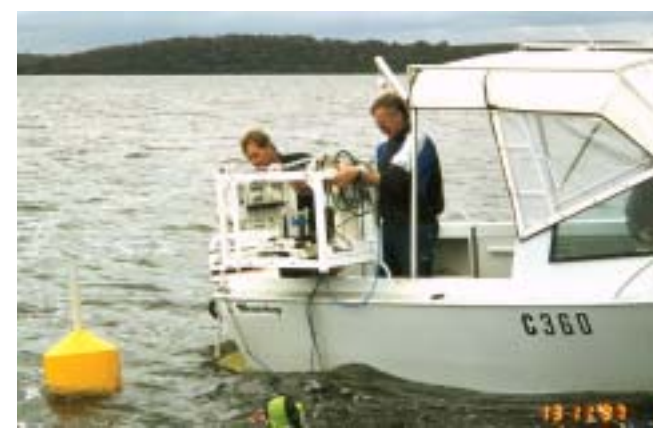
AGSO benthic chamber being lowered into the inlet (to accompany sediments results section)

We use the term stratification to describe the condition where the denser incoming sea water from the open bar slides under the outgoing fresher and therefore lighter estuary waters. Because of the high amount of organic matter in the sediments the oxygen in the bottom water is quickly depleted when stratification sets in.