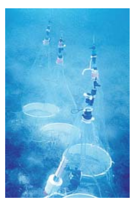
No caption supplied for the picture above.

These pictures are the only ones supplied that are suitable for use in Wilson 4 (at a push!!!) and they are shown at the maximum size at which they will decently reproduce.