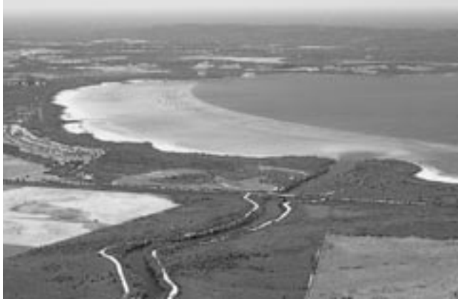
Hay River entering Wilson Inlet

In response to public concern about the state of the Inlet the Wilson Inlet Management Authority was established in 1994 with modest funding for scientific studies and management of the Inlet.