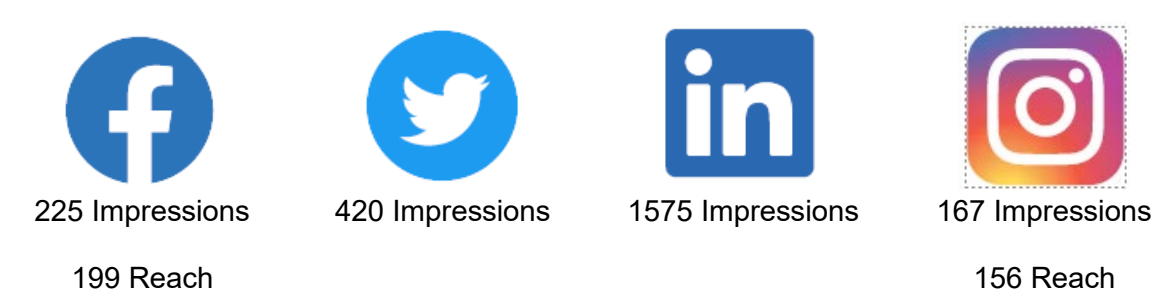
Figure 1 - Social Media Reach

A total of 133 submissions were received from a range of stakeholder groups. These submissions were reviewed and analysed in detail to help identify refinements to be made to the proposed changes to the DAP system.