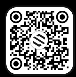
View Our Work