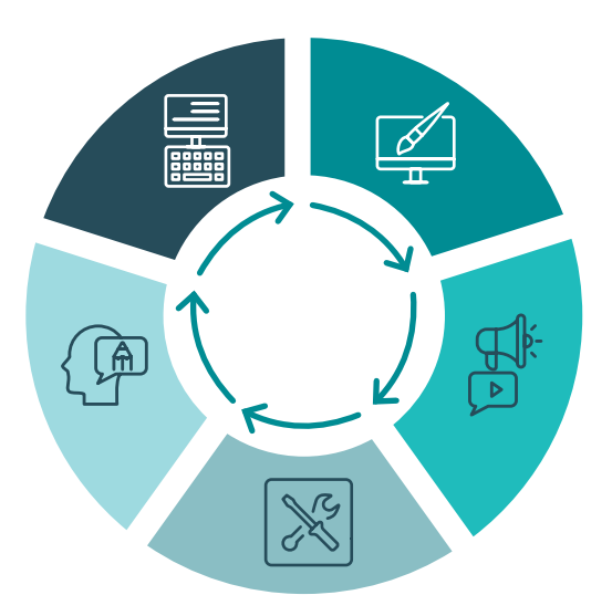
Figure 1 - Data collection cycle

Data collection should be ongoing to ensure continuous improvement of policies and practice which respond to current issues. See Figure 1 below.