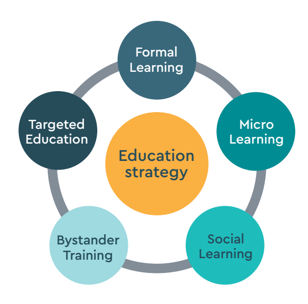
Figure 2: Education strategy