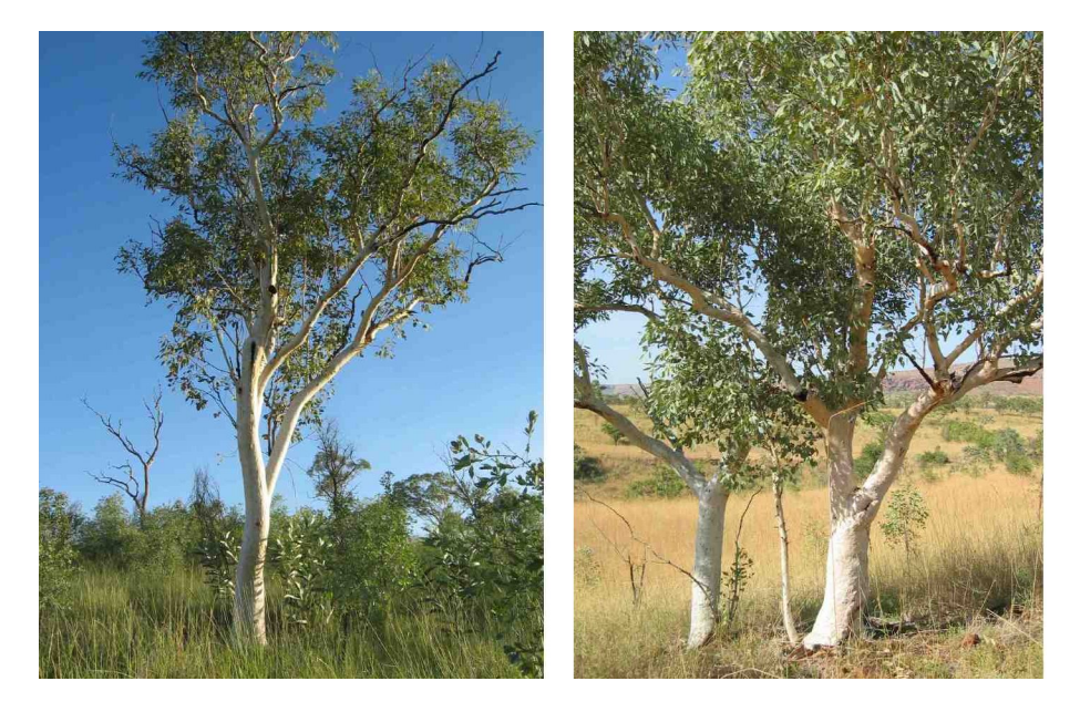
Figure 1. Breeding habitat in the Project area showing suitable nesting trees.