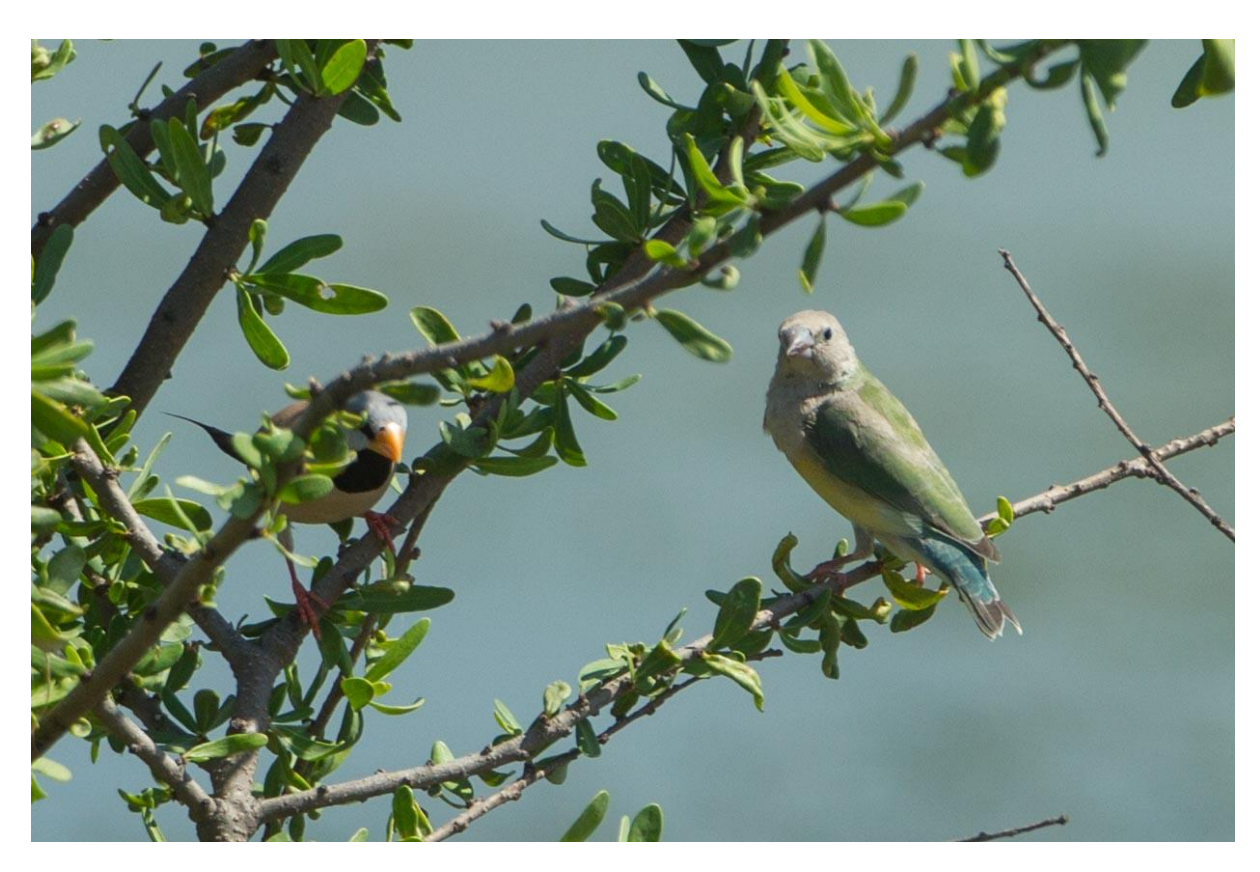
Figure 3. Gouldian Finch (right) with Long-tailed Finch recorded during the October 2020 survey