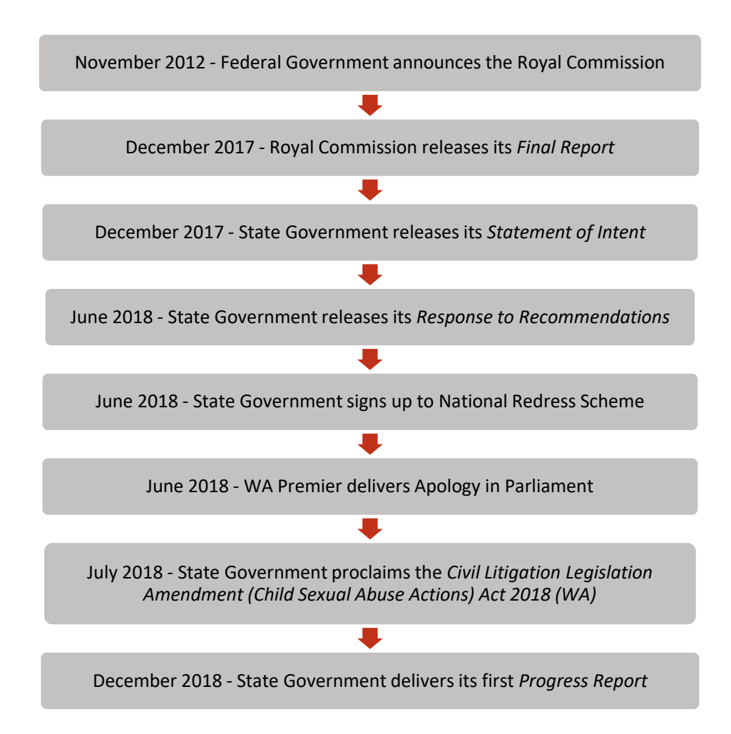
Figure 1: Timeline of key achievements in the first year of implementation