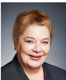
Hon Sue Ellery MLC Minister for Finance

Strategic commissioning reflects a different way of thinking and is about State agencies working together to create services that support better outcomes for Western Australians. This Policy reflects a strategic commissioning approach at the centre of our decision-making process and guides the important ongoing work with Aboriginal Community Controlled Organisations and the not-for-profit community services sector to improve the lives of some of our most vulnerable people.