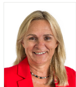
Hon Sabine Winton MLA Minister for Community Services