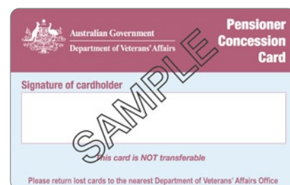
Department of Veterans' Affairs Pensioner Concession Card

DVA Gold Cards not embossed with TPI, EDA or War Widow are not eligible to apply. DVA members with Blinded War Pensioners, Tuberculosis or eligible for SRDP will need to provide a letter from the DVA to confirm their eligibility.