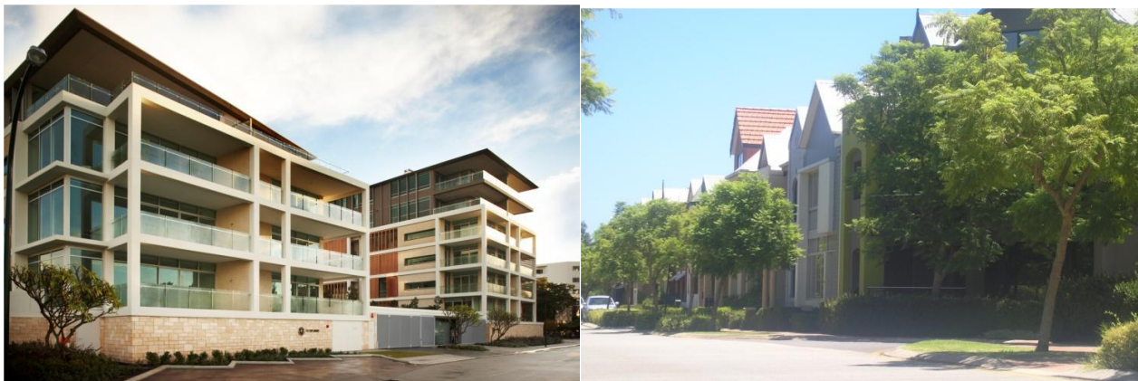
Figure 4 –Examples of Desirable Built Form

The Clarkson Activity Centre Plan has a key focus on the main-street elements which will enable a number of key focal points to be established, along with the ongoing development of a mixed use centre.