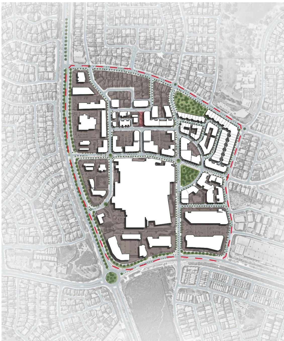
Figure 5 – Indicative Future Built Form