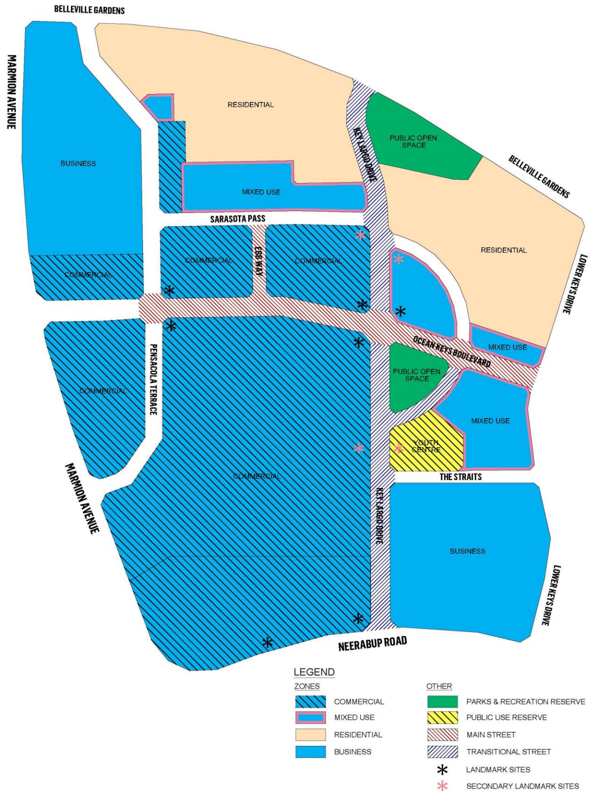
Figure 1 – Clarkson Activity Centre Plan