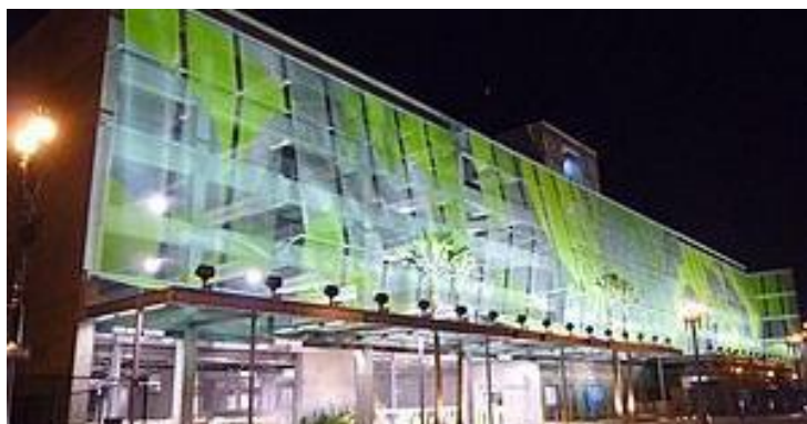
Figure 6 – Interim Transitional Street Building Treatment Example

It is important that the majority of the Ocean Keys Boulevard main-street is developed prior to the commencement of this form of development along Key Largo Drive. That is, one successful main-street is more important than two mainstreets that are only half completed. Accordingly Key Largo Drive and the area around the existing open space has been designated as a Transitional Street, whereby current development, in a format not normally consistent with main-street development, should ensure that the building form and location does not compromise the future development of the Transitional Street to a main-street.