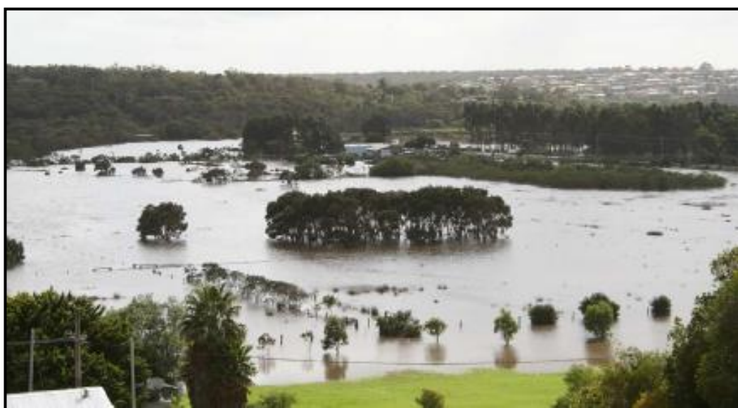
2005 - Flood/Yakamia Creek