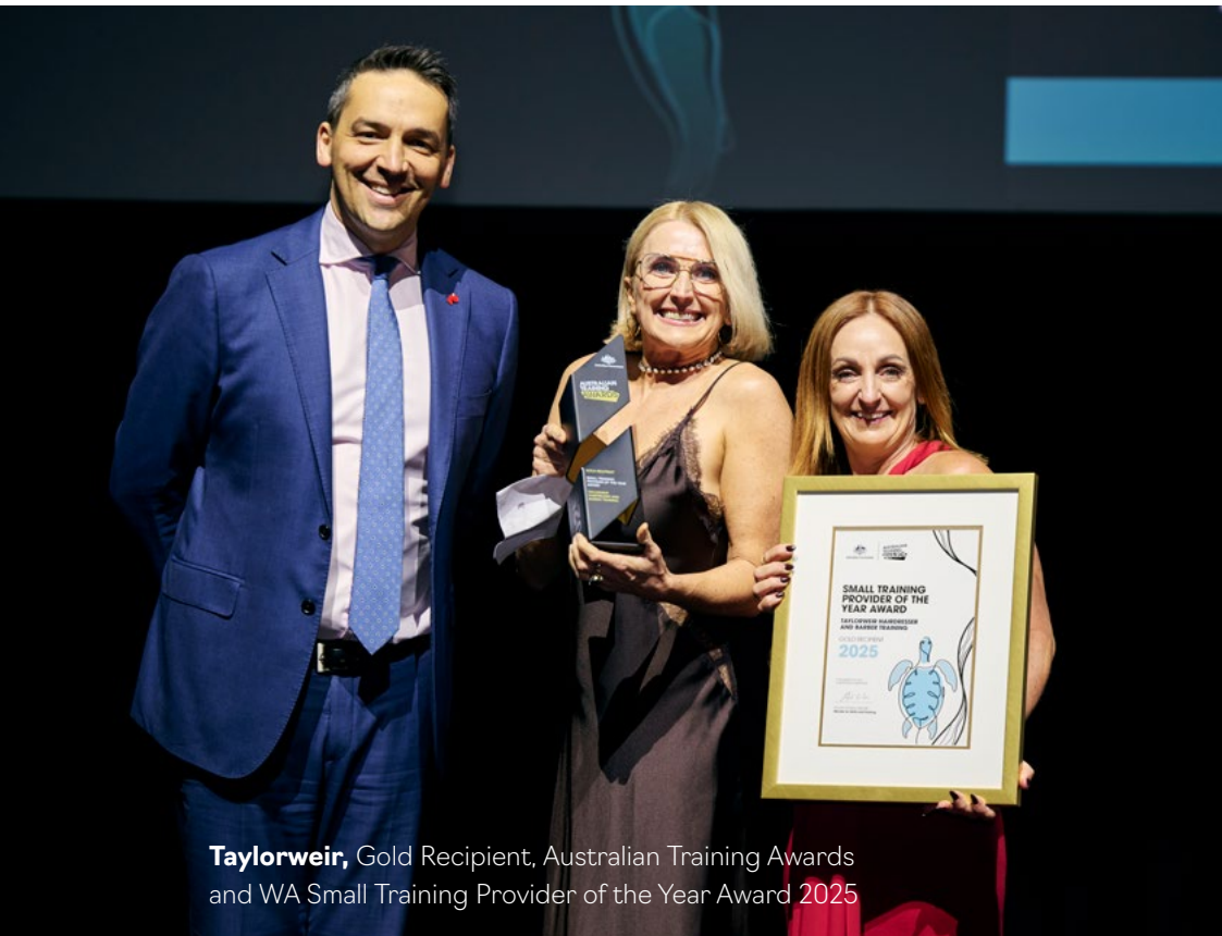
Taylorweir , Gold Recipient, Australian Training Awards and WA Small Training Provider of the Year Award 2025