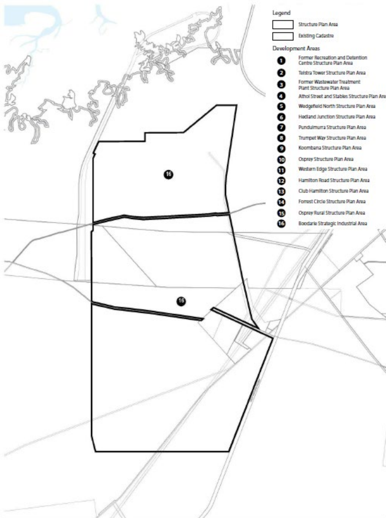
Schedule 2 - Structure Plan Areas