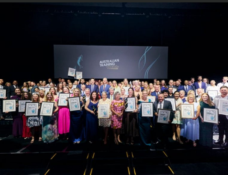
2025 Australian Training Awards