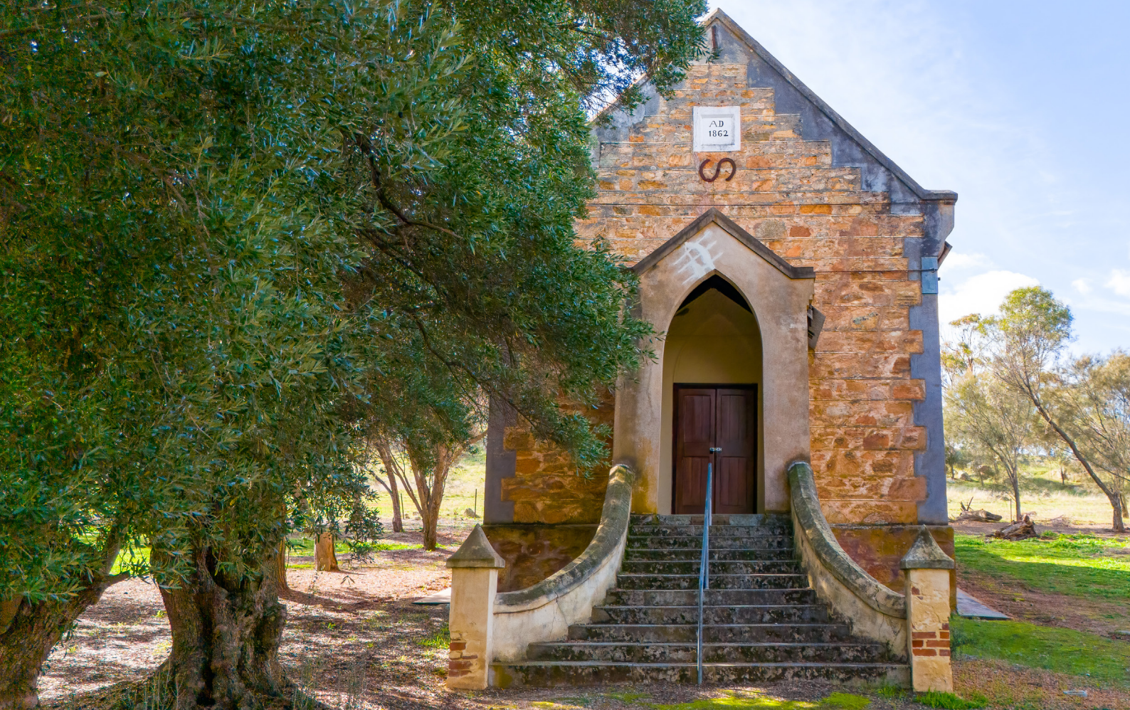
Image (above): Northam, St Saviours Church, Katrine Road – M Blackhurst

Image (cover): Northam Flour Mill, with The Last Swan mural - FORM – M Blackhurst