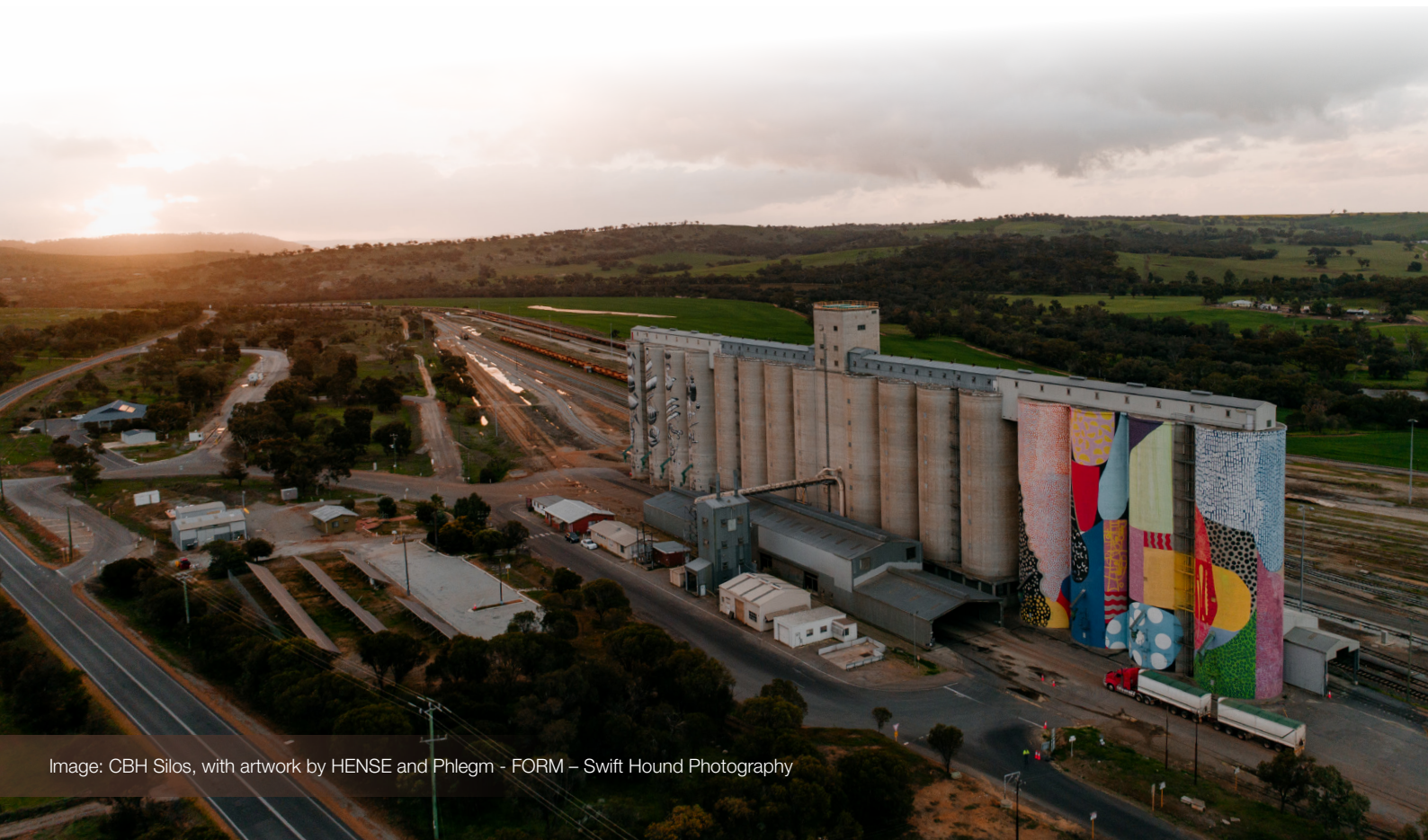
Image: CBH Silos, with artwork by HENSE and Phlegm - FORM

The NLE is the only Aboriginal grower group in Australia, 5 yrs ago the NLE employed its first employee, it now employees 20 plus staff with over 50% being First Nations. Much of our work is based on Ballardong Boodja including our Boola Boornap native tree farm which is located 5kms Perth side of Northam and will produce in excess of 1 million native seedlings this year for land