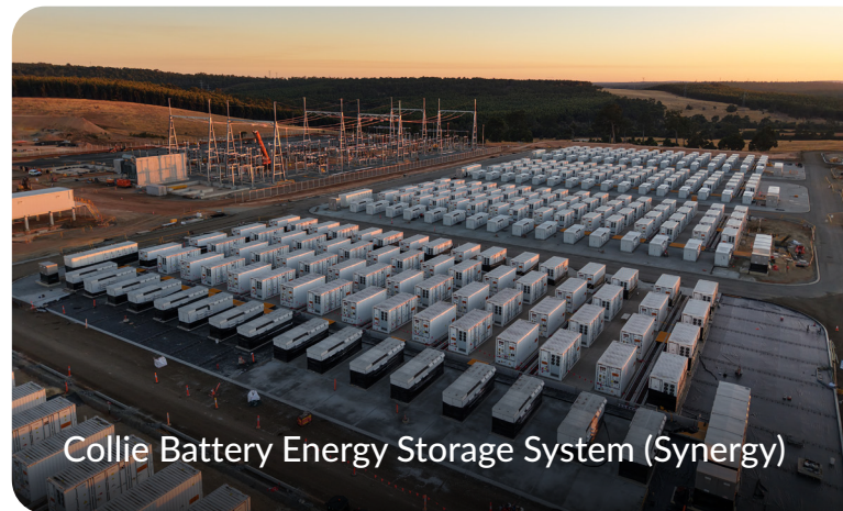
Collie Battery Energy Storage System (Synergy)

The battery adds modern energy storage to the town's long standing role in powering the State, reinforcing Collie's place in Western Australia's energy future as the transition of both the town and the wider grid continues to evolve.