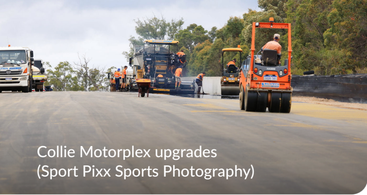
Collie Motorplex upgrades