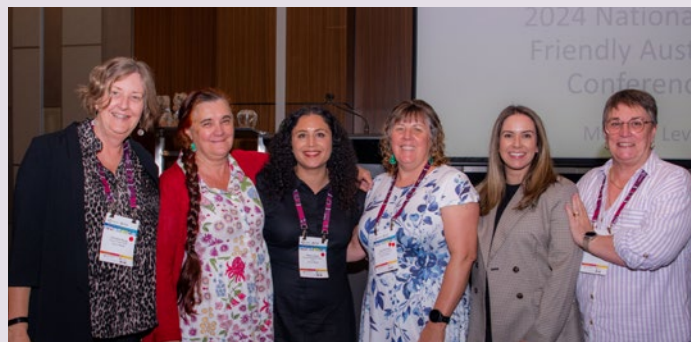
Members of the Conference Planning Committee together with representatives from the Department of Communities, World Health Organisation, New Zealand Office for Seniors and La Trobe University Centre for Rural Ageing Research.

Delegates travelled internationally from Slovenia, Brunei, New Zealand, Switzerland, Ireland, United States of America and from Queensland, New South Wales and Victoria to exchange, share and learn about the opportunities of age-friendly communities.