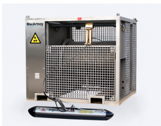
Side scan sonar system