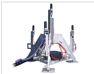
Critical underwater infrastructure surveillance