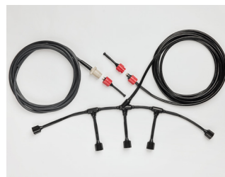
Connectivity solution for navy vessel hydrophone array