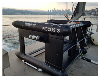
ROTV system for detecting and classifying UXO (Unexploded Ordnance)