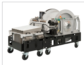
Autonomously operating winches for naval application on USVs