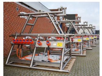
Subsea frames: versatile underwater instrumentation platforms