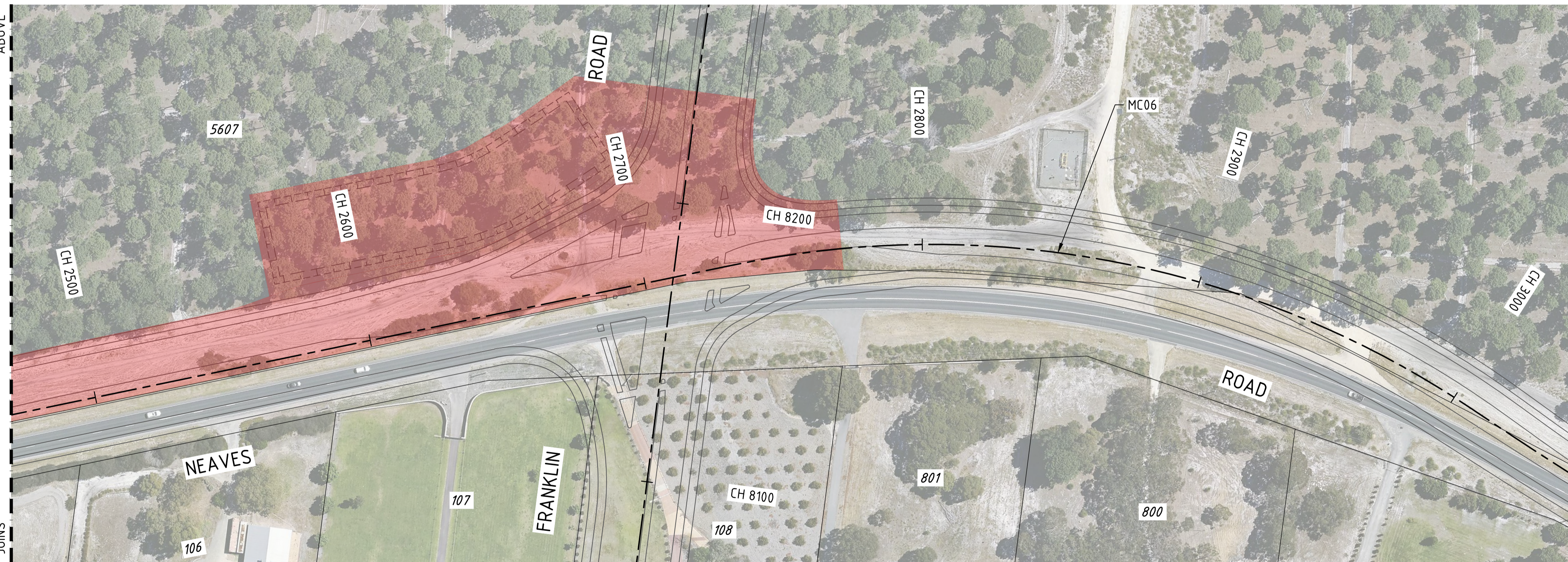
PLAN (CONT.) 1:1000