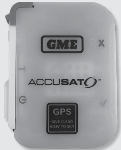
An example of a small, lightweight PLB.

The PLB is a small device that, when activated, transmits a message via satellite to emergency services. Coordinates transmitted by the PLB are used by rescuers to pinpoint its location.